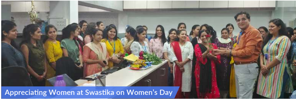
Appreciating Women at Swastika on Women's Day