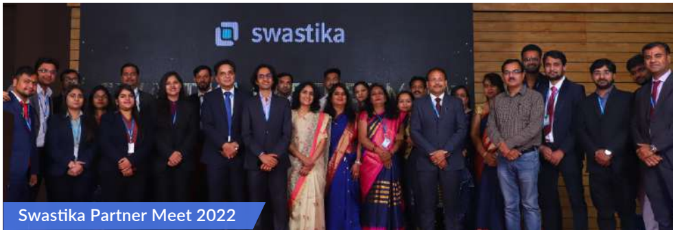
Swastika Partner Meet 2022