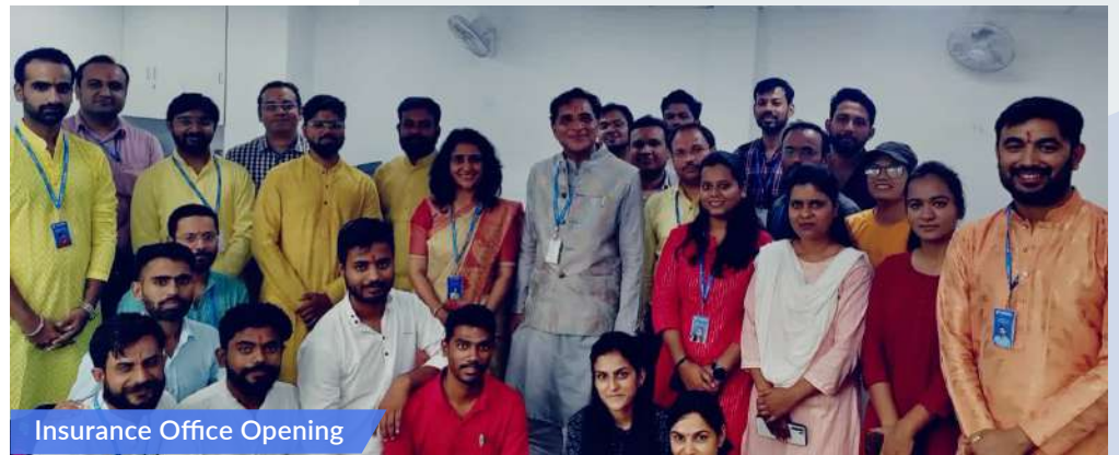
Insurance Office Opening