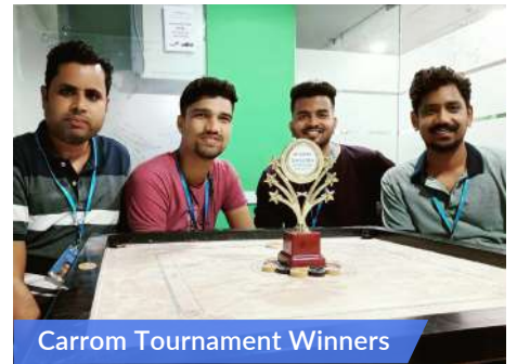
Carrom Tournament Winners