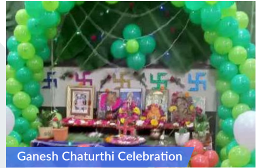
Ganesh Chaturthi Celebration