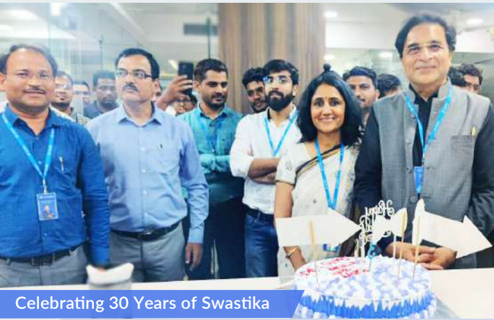
Celebrating 30 Years of Swastika