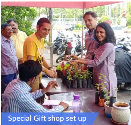
Special Gift shop set up