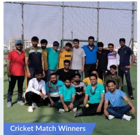
Cricket Match Winners