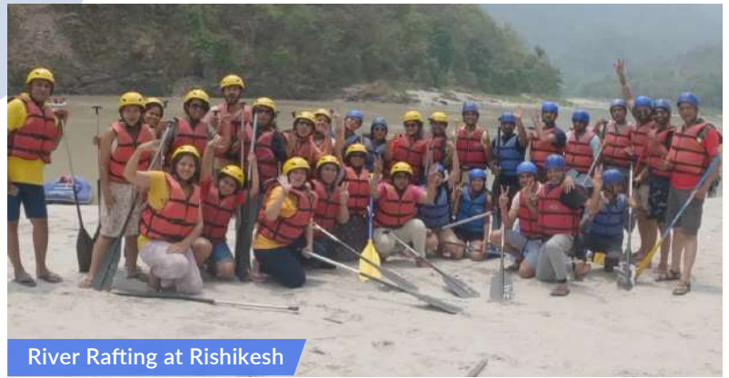
River Rafting at Rishikesh