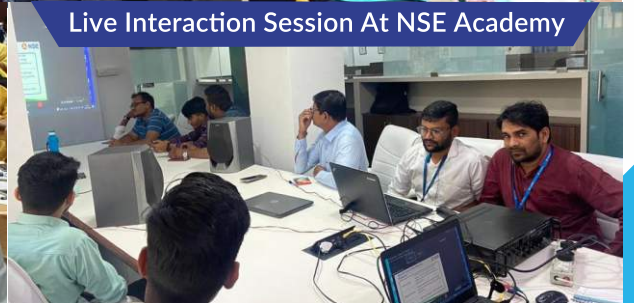
Live Interaction Session At NSE Academy