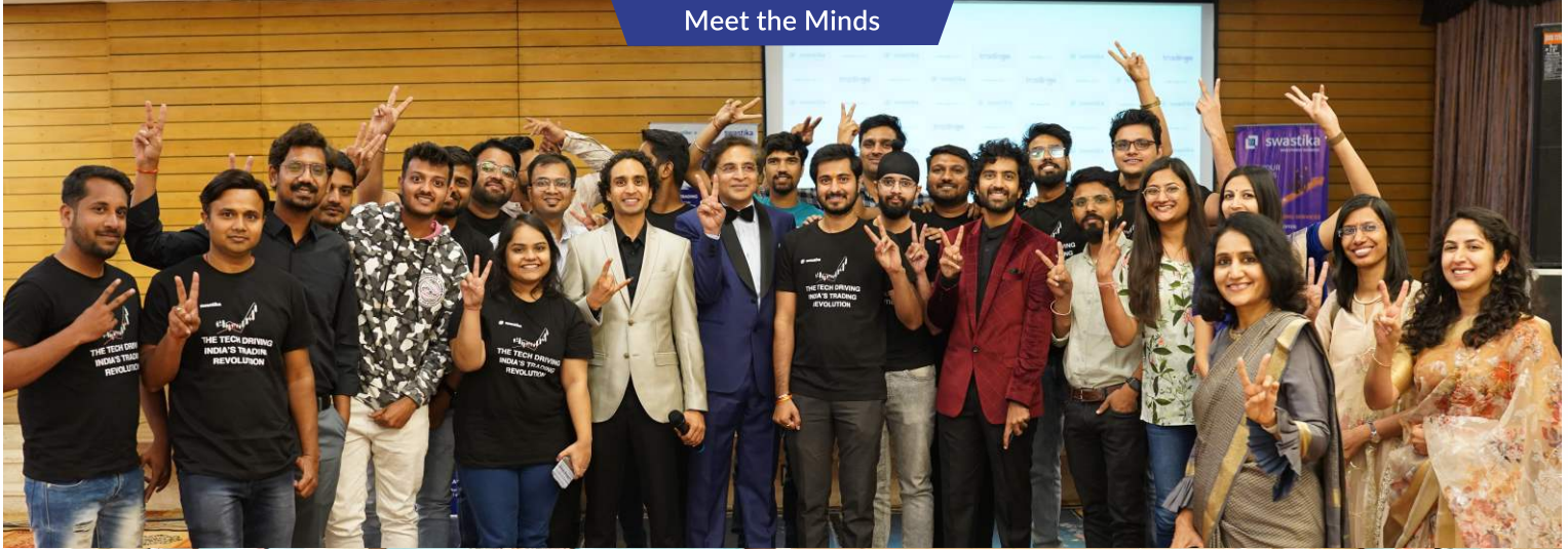
Meet the Minds