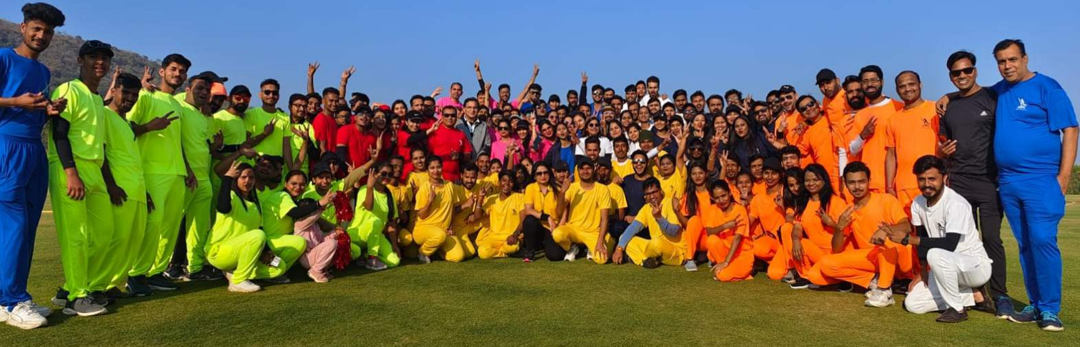
Fun At Work : POTLUCK