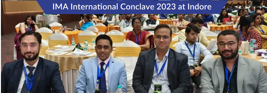
IMA International Conclave 2023 at Indore