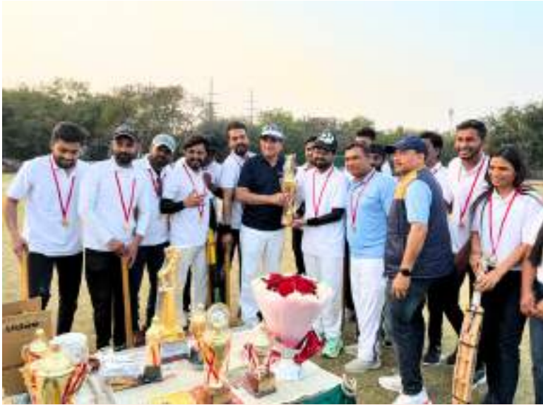
Winning team - DT Zone