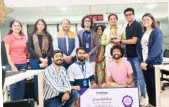
Winners : TTT - The Tomorrow Team