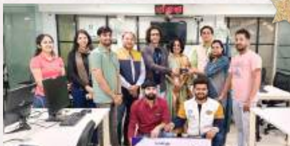
Winners - Team Optimus

'Swastecha 2.0' wasn't just about innovation; it was about building a foundation for future collaboration. This event leaves us energized to keep exploring new possibilities and unleashing the combined power of creativity and teamwork."