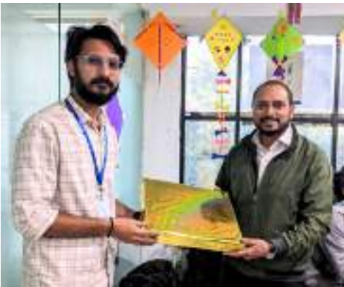
Celebrating Makar Sankranti with Kite making competition