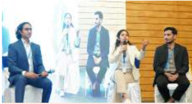
A discussion on Wealth Bags