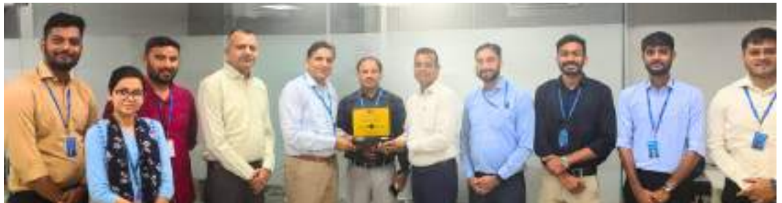
Recognition from MCX for 20 years of dedication and excellence