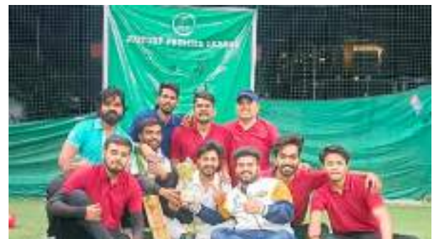
Winning team at JustTurf Premier League