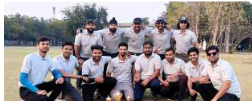
Runner up team - Tech Tigers