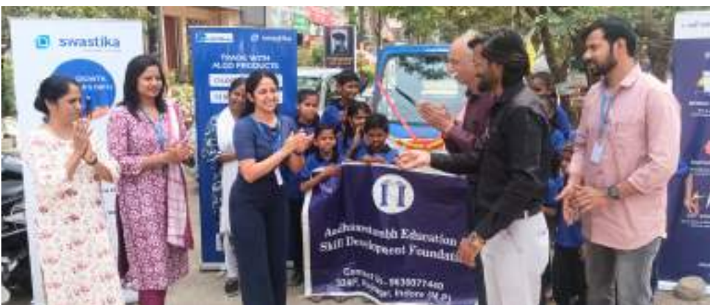
Wheels of Support- Swastika's CSR for Children's Education with E-Rickshaws