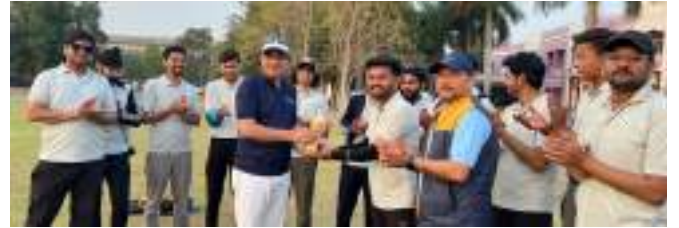
Winners - Team CFO