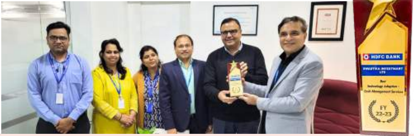
Best Technology Adoption - Cash Management Services FY 22-23 Award by HDFC Bank