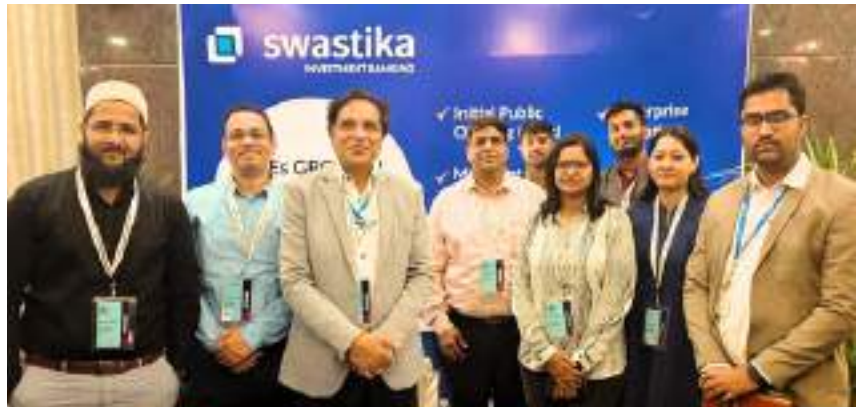
31st IMA International conclave 2024